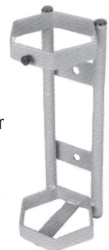
Wall Mount Holds 1 D or E Cylinder Item #7000

Are you looking for a rack or cart not shown? We offer many more options to choose from. Inquire today, 1-888-883-7331.