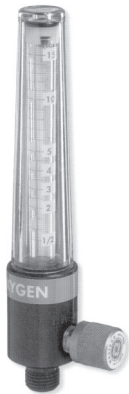
Slim Line Flowmeter Item #7501-MRI