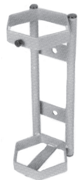
Item #7000-MRI Wall Mount Holds (D or E) Cyl's