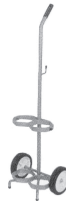
Item #7002-MRI Holds 2 (D or E) Cyl's