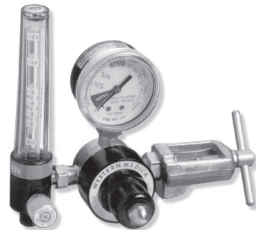
Single - Stage Flowmeter Regulator ½ - 15 LPM, 50 psi Present, CGA-870 Yoke Item #7715-MRI