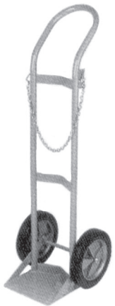
Item #7004-MRI Holds 1 (H or T) Cyl.