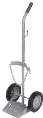
Item #7005-MRI Holds 1 (M or M60) Cyl.